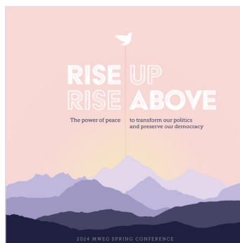
2024 Spring Conference A More Perfect Union (Full Speaker Playlist) March 2024