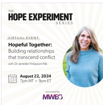
Hopeful Together Free Virtual Event August 2024

Feel free to view recordings from previous conferences and events: